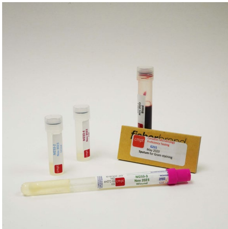
An example Clinical Bacteriology shipment. Shipment contents may vary between surveys.