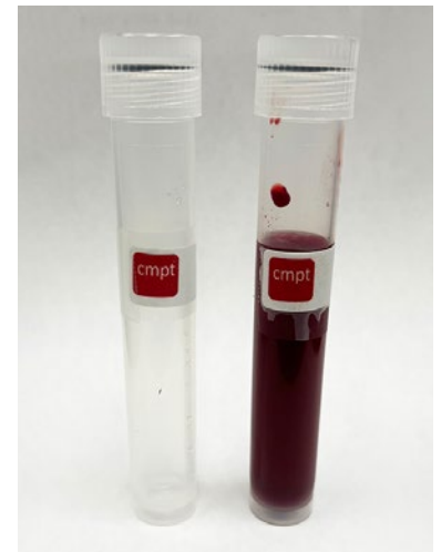
Simulated blood sample.

*due dates are subject to change; specific dates will be announced with the shipment