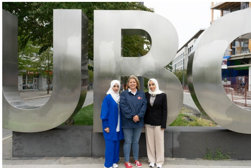
Participants in our International Training Program, 2024.

Please contact CMPT for more information.