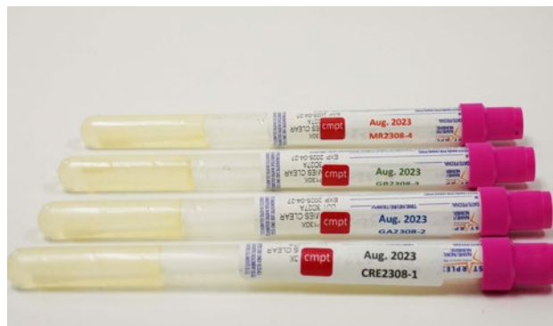
Samples for our Screening/Molecular programs, including GAS, GBS, VRE, CRE, and MRSA.

CRE, VRE, MRSA, GAS, and GBS programs ship together to save you money on shipping!