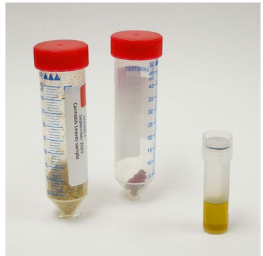
Simulated cannabis product samples, including flower, candy, and oil.

*due dates are subject to change; specific dates will be announced with the shipment