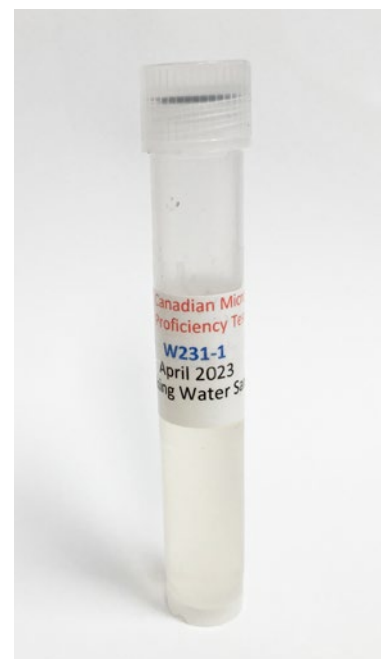
Simulated drinking water sample.