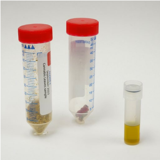
Simulated flower, candy, and oil samples.

*due dates are subject to change; specific dates will be announced with the shipment