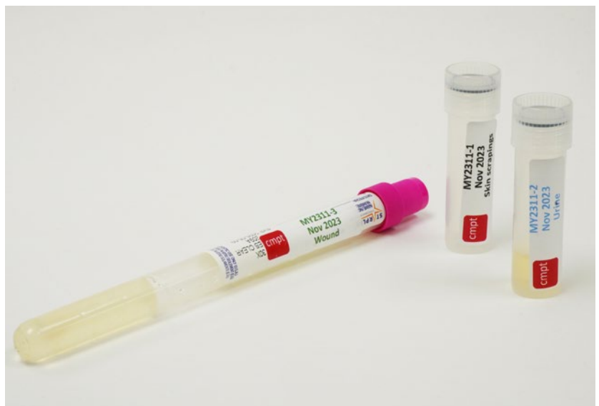
Mycology program samples: wound swab, skin scrapings, and urine.

*due dates are subject to change; specific dates will be announced with the shipment