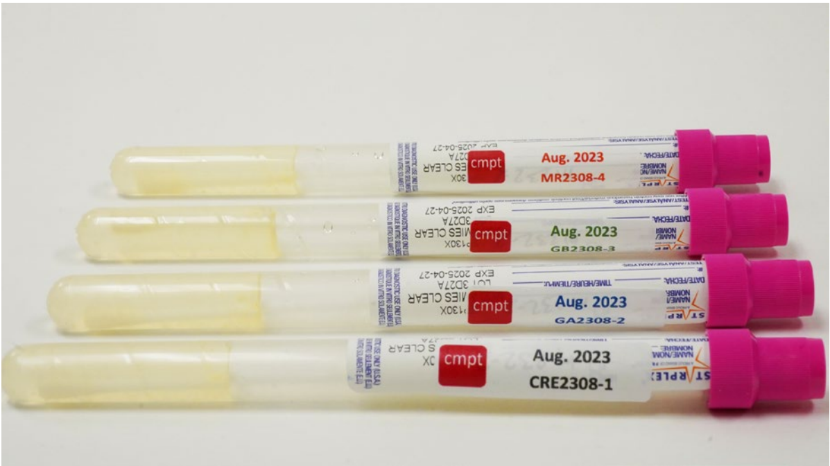
Simulated wound swabs.

*due dates are subject to change; specific dates will be announced with the shipment